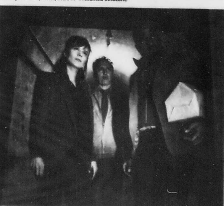
Katja Herbers as Kristen Bouchard, Asaf Mandvi as Ben Shakir and Mike Colter as David Acosta in 'Evil.'

For another thing, Jake Gyllenhaal is starring as Rusty Sabich, the assistant district attorney who gets caught up in a sensational murder case.