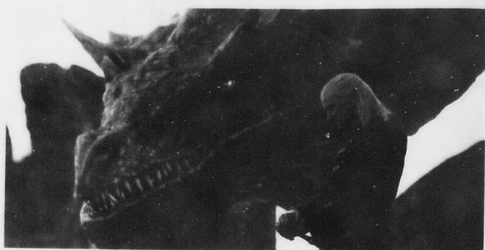
Prince Daemon Targaryen (Matt Smith) and his dragon, Caraxes, on 'House of the Dragon.'

Absolutely. For one thing, Turow's book is terrific and makes excellent source material. For another, David E. Kelley — the man behind truly great TV like 'L.A. Law,' 'Picket Fences,' 'The Practice,' 'Ally McBeal' and 'Big Little Lies' (just to name a few) — is the writer/showrunner of the new 'Presumed Innocent.'